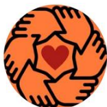
Morgantown WV Mutual Aid

OSAGE GOSPEL 'N SOUL COMMUNITY CHOIR: The next meeting should be Monday, April 28th at the Ferry House at 6:00 p.m.