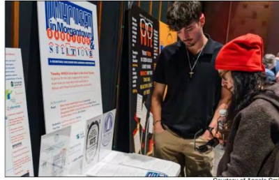
Community members examine literature on display at the "Unhoused in Morgantown: Barriers & Solutions" roundtable at the Mountainlair Gluck Theatre on Tuesday evening