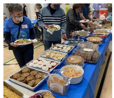
There were many desserts!