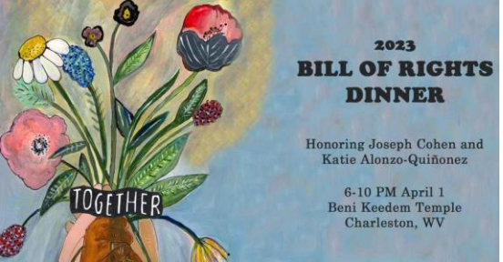
ACLU OF WEST VIRGINIA UPDATES:

"Join the ACLU-WV staff, board and friends for an evening of civil rights and celebration!"