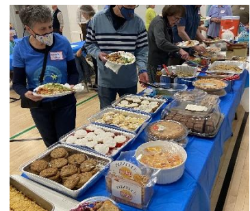
There were many desserts!